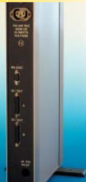
RS-232 output and analog ports are conveniently located on rear side

While most of our Trendsetter II readouts are used in single element manual gaging applications, we can configure them for use in multi-dimensional automatic measuring applications. Part status may be communicated with the use of an optional internal plug-in board. Such conditions can be informed by communicating with a light or audibly by ringing a bell or even open a sorting gate to separate good and reject parts. Obviously, automatic gaging is a much more comprehensive and complex solution and requires expertise in which Edmunds Gages is world-renowned.