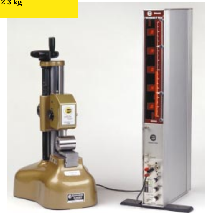
High Magnification Comparator

Our Trendsetter, TM an electronic column equipped with a high speed peak detector module, detects and captures the dynamic peak of cylindrical parts instantly and accurately. Cylindrical pieces are simply and quickly swept past the measuring contacts of our single-head comparator. This measuring system is suited for close tolerance applications featuring selectable scales starting at .0001" full scale with .000001" resolution. The reset circuit can be activated manually or automatically by programming the time delays. Enhancing its versatility, it can operate in either English or Metric modes.