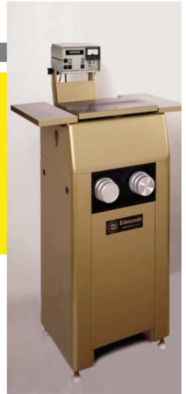
Universal Internal/External Comparator